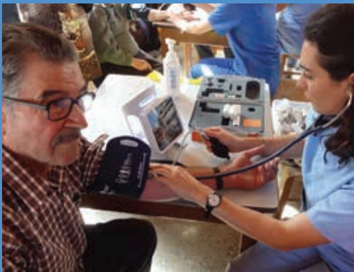
Blood pressure measurement at a remote village of Troodos mountains