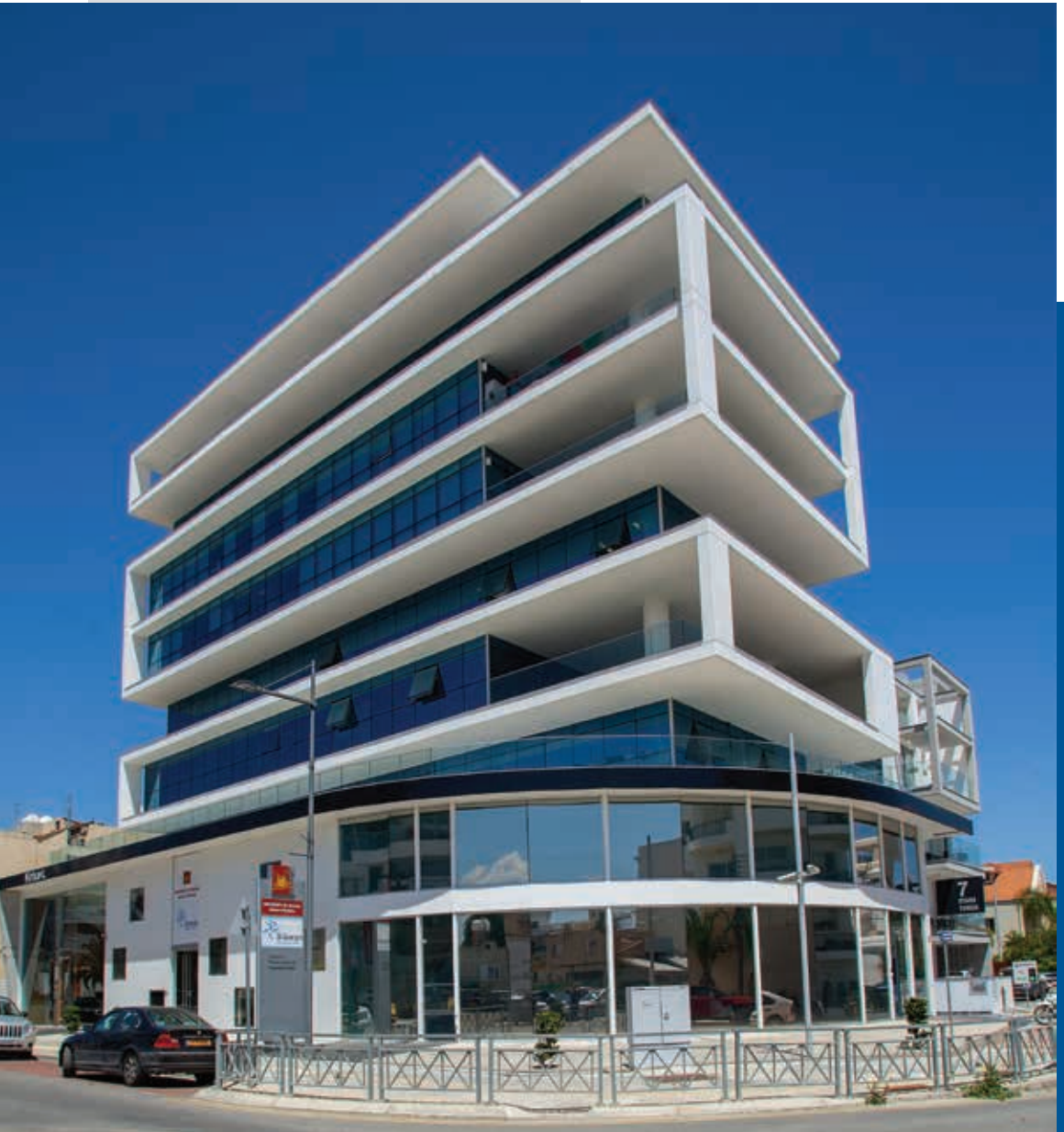
Department of Primary Care and Population Health