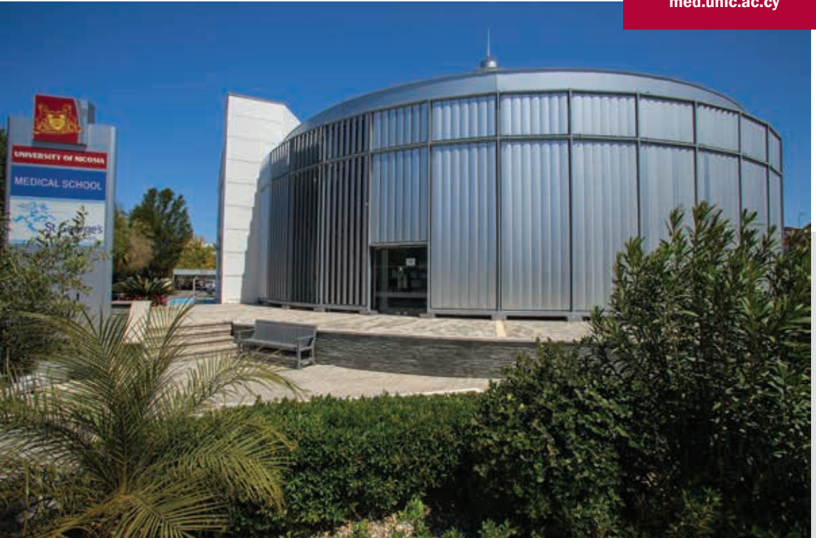
Medical School Block A

In October 2010, the University of Nicosia was awarded the Diploma Supplement Label by the European Commission, one of only 106 European universities to hold this distinction. The University of Nicosia is also actively involved locally and internationally with campaigns for various causes, such as the support of an orphanage and hospital for HIV-positive children in Kenya, diversity, migration, gender and racial equality issues, and environmental protection. In recognition of this work the University of Nicosia received the prestigious “Global 500” award from the United Nations.