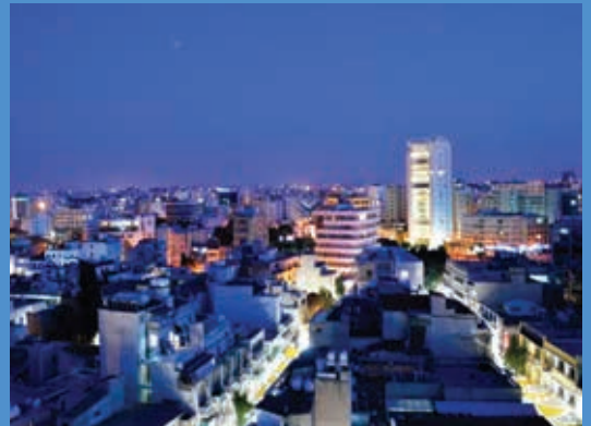
Nicosia by night