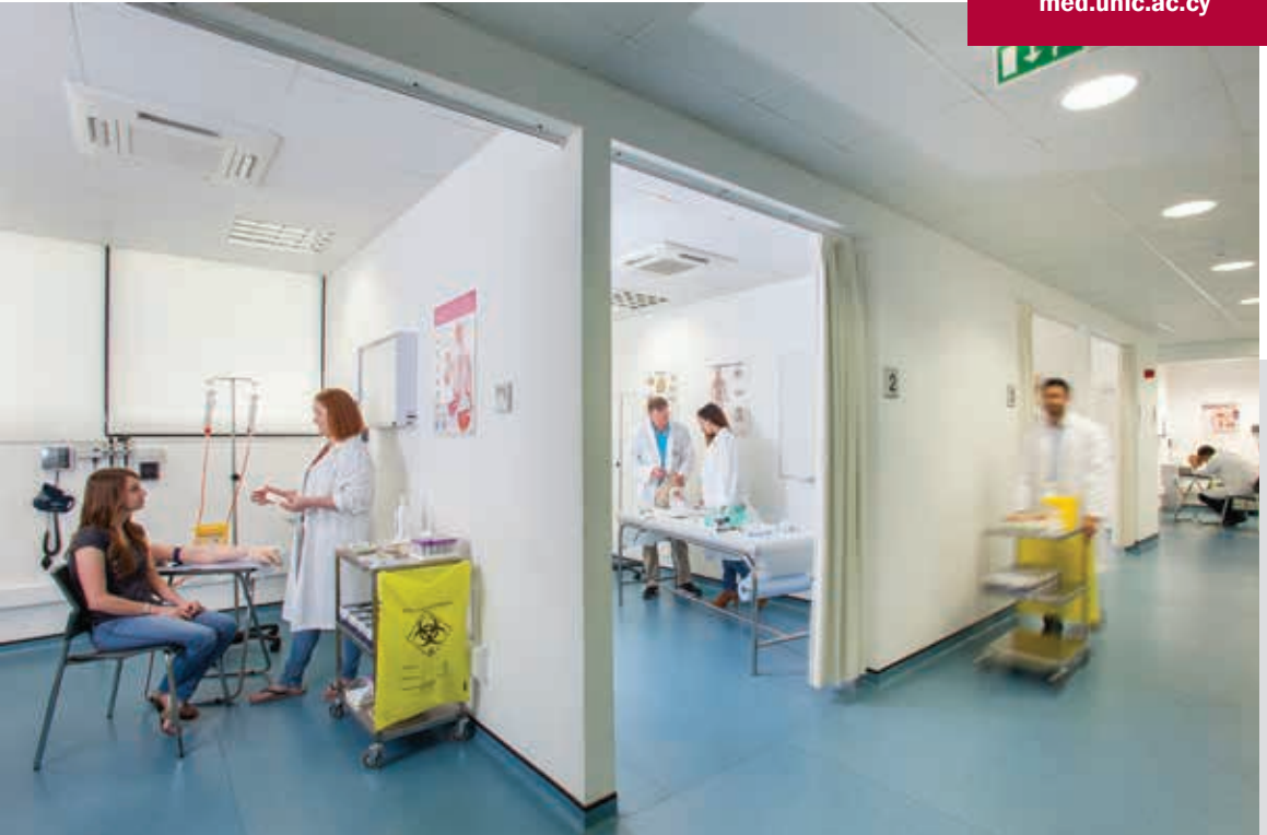
Clinical Skills Laboratories