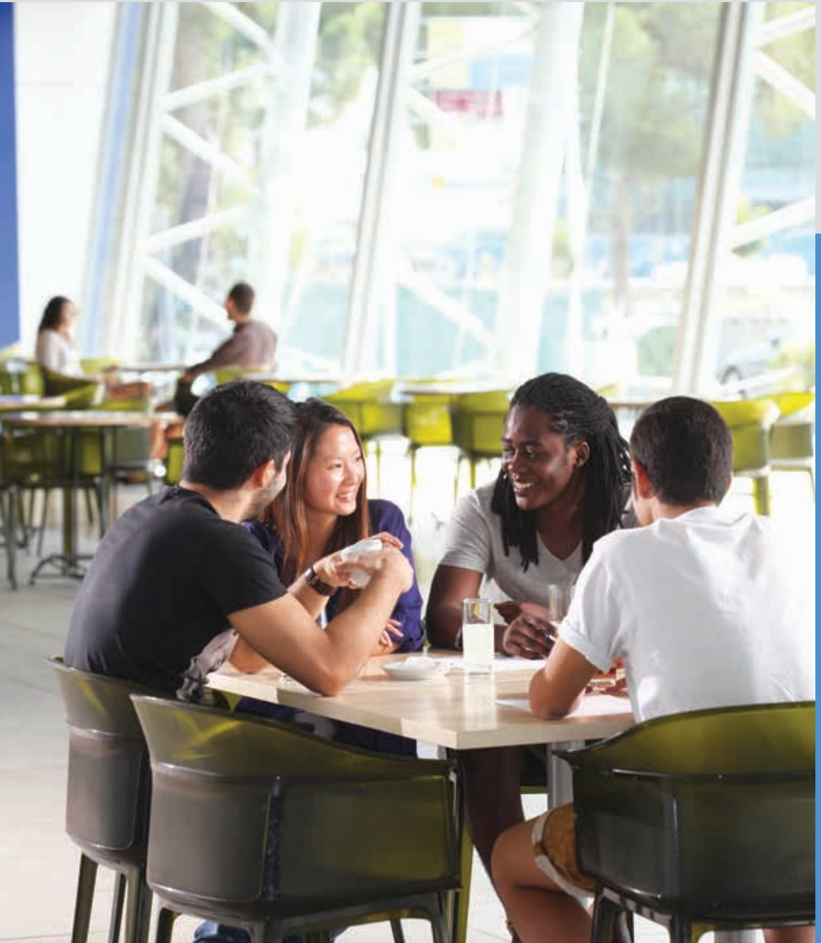
UNICAFE Restaurant at the Research and Technology Building