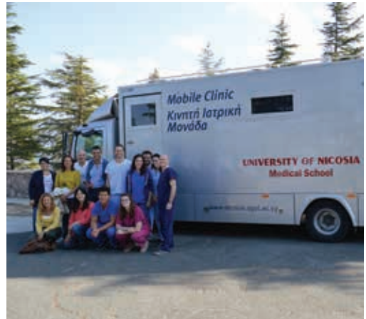
November 2, 2013: Inauguration of the Mobile Clinic with an expedition to Kambos and Tsakistra villages

Medical Students get the chance to participate in Mobile Clinic expeditions organised by the school throughout the academic year. Supervised by clinical faculty, student volunteers offer free diagnostic tests to residents of remote areas and to specific populations in need. They also raise health awareness by presenting various topics followed by related tests. The expeditions offer the opportunity for inter-professional learning opportunities by collaborating with other health professionals and by learning from each other through collaborations with medical societies and health-related NGOs.