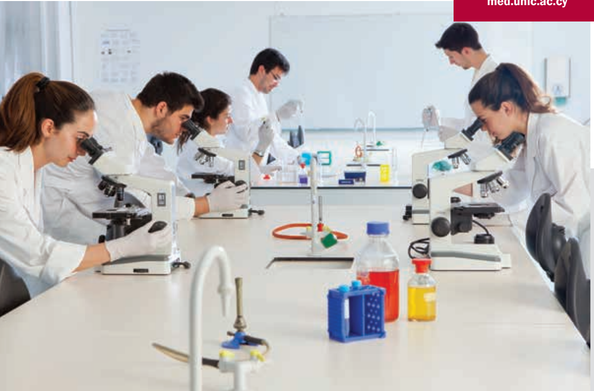
Cell Biology Laboratory