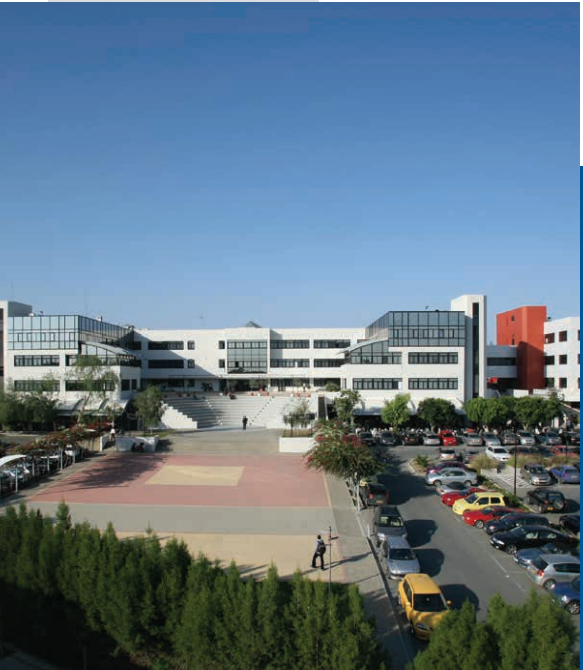
University of Nicosia main campus