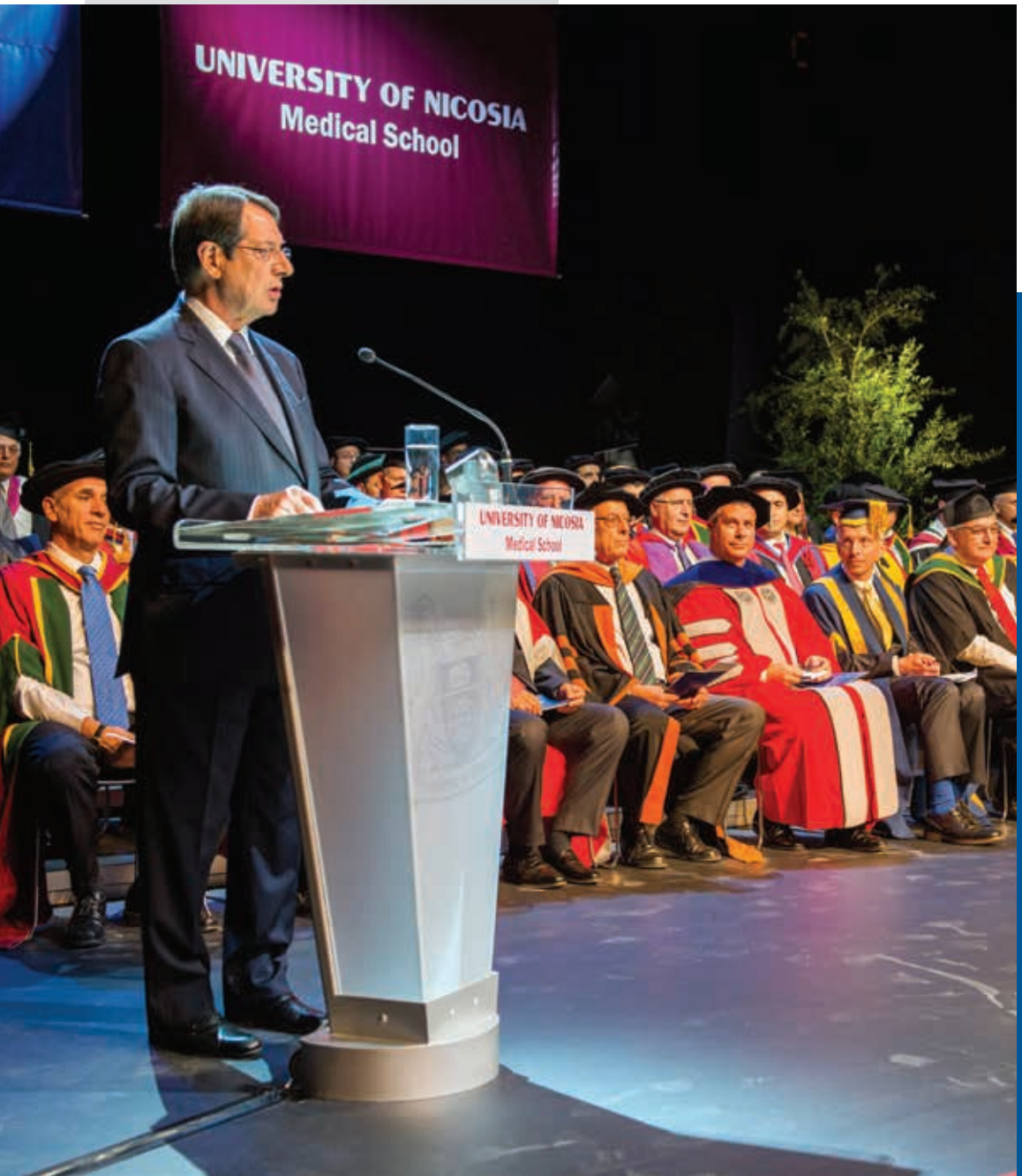
President of Cyprus Nicos Anastasiades