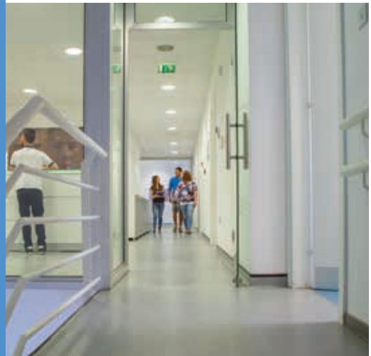
Medical School, Block B

You can begin your application online at med.unic.ac.cy