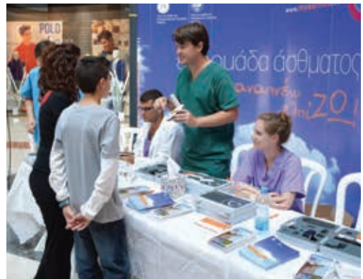
Spirometry tests during asthma week in one of the shopping malls in Nicosia